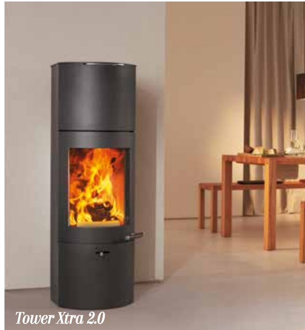
Tower Xtra 2.0