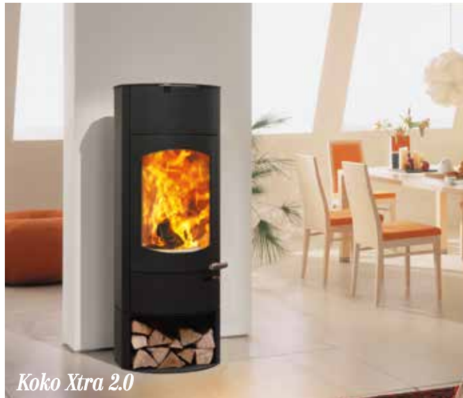
Koko Xtra 2.0