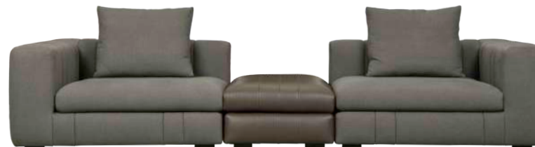
module 1.1 left + pouf + module 1.1 right