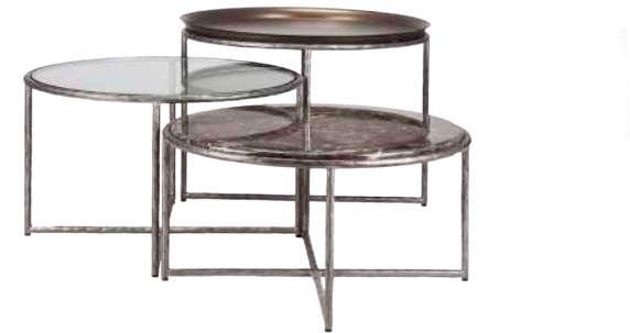
ETRA COCKTAIL . TABLE

The Etruscan inspired hammered iron of these cocktail tables brings a bit of ancient world charm to an otherwise contemporary form. Three different surfaces – glass, Emperador marble and a bronze enamelled iron tray top – allow for visual diversity and texture.