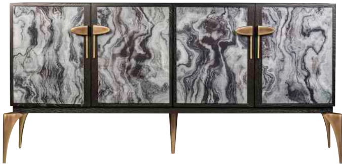
MANOLO . SIDEBORD

Hand-cast brass legs give this piece a nice lift, as we give a nod to its namesake. Manolo is a distinctive sideboard with an endless array of door facade options. Its cast brass handles, in harmony with its legs, repeat their form. The dark oak structure gives the appropriate air of sobriety to your choice of fabric along with its lovely brass accents.