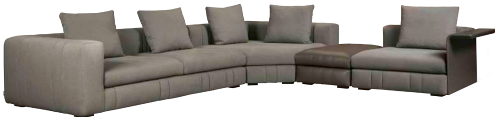
module 2.1 left + corner + pouf + module 1.0 right + optional leather armrests