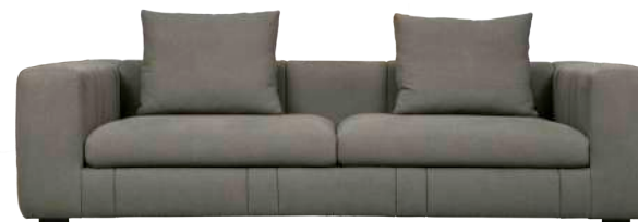
sofa & sofa bed