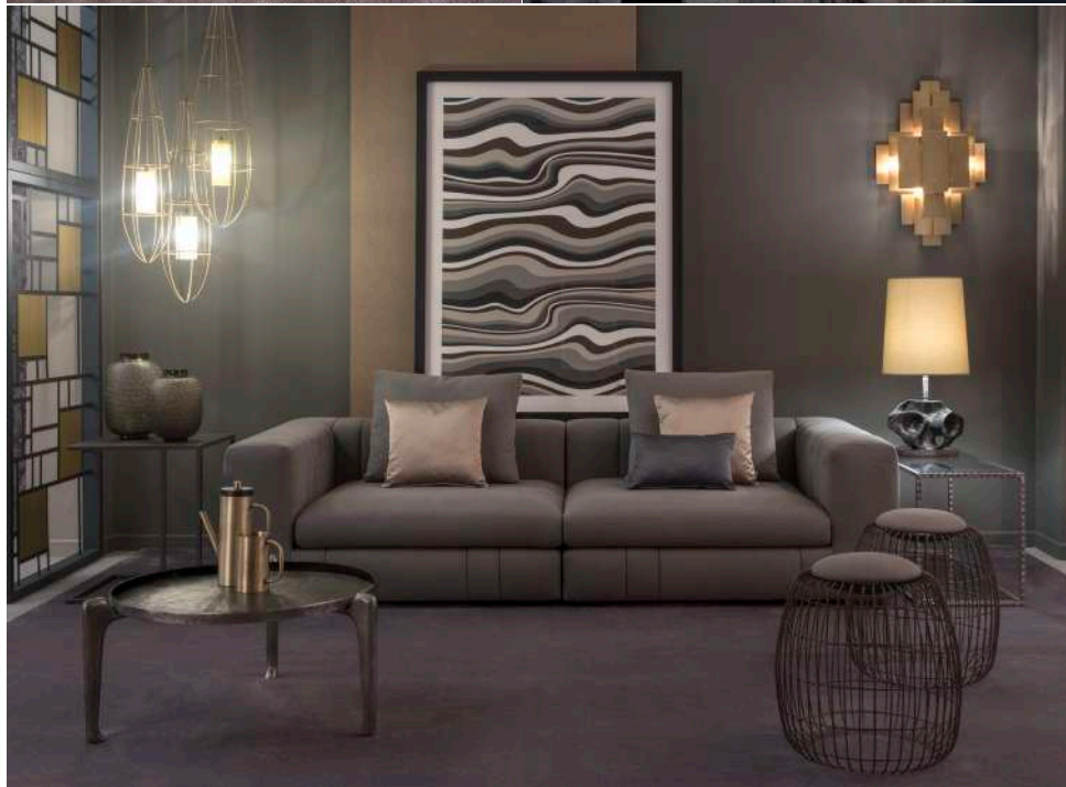
DONATO . POUF