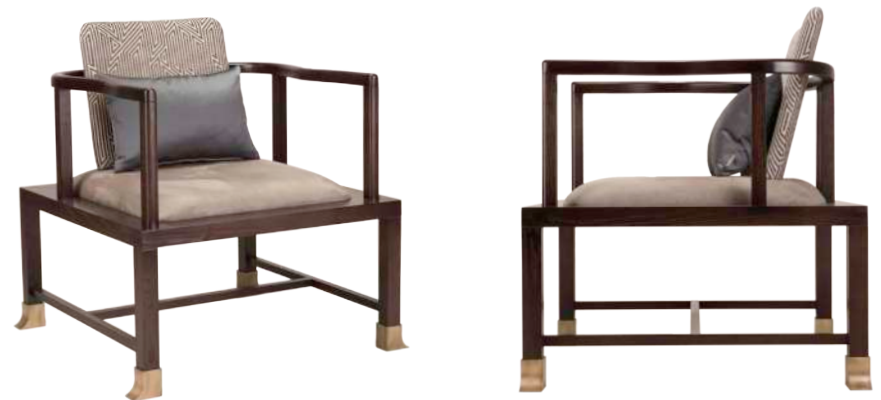
SOLATA . ARMCHAIR

The name is a reference to the designer's first experience with Asian culture from childhood while the inspiration of this armchair comes from the imperial porter chairs once used in Asia for royals and officials, with obvious adaptations to 21st century life. The addition of cast brass feet adds a slightly more European feel to this Asian inspired piece. It is a great piece to include in one's interior for a bit of eclecticism and handmade detail.