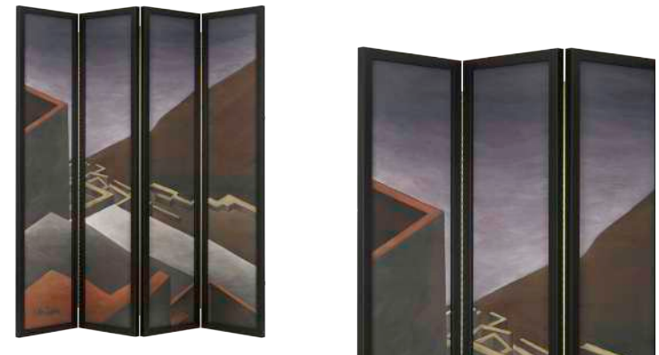
MACHU PICCHU . ART