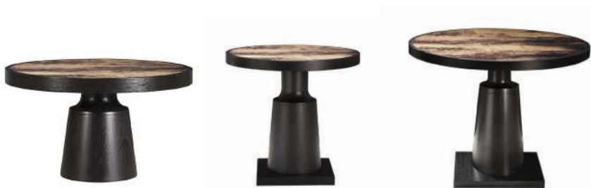
POMPEIA COCKTAIL / BAR / DINING . TABLE

With their gilded glass tops and brushed ash construction, this range of tables will liven up any space. Available in coffee and side table as well as bar and dining table versions.