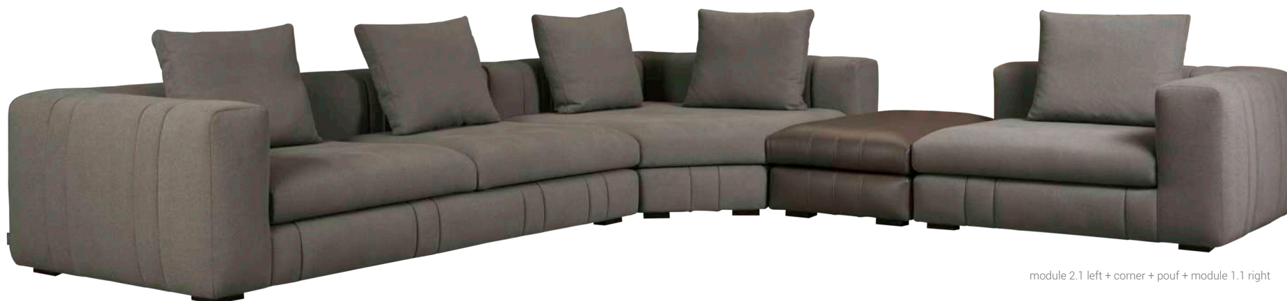
module 2.1 left + corner + pouf + module 1.1 right