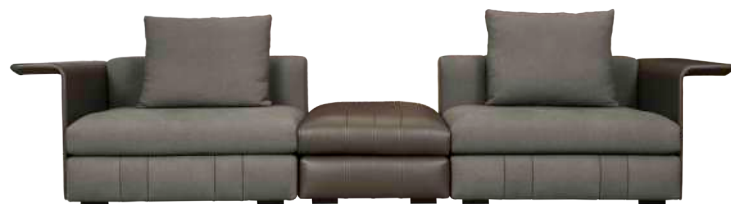
module 1.0 left + pouf + module 1.0 right + optional leather armrests