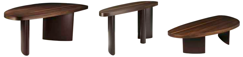
SILAS DINING / CONSOLE / COCKTAIL . TABLE

These tables were inspired by the Eucalyptus forests of Portugal, and the name is a nod to the Roman God of Forests. The idea was to show the force of the material, making a monolithic structure showing wood in all its massiveness. Contemporary lines and thickness confer to this table a strong presence in any interior. The Eucalyptus veneered top adds texture and visually lightens the weight of the brushed ash legs. Available in Dining, Console and Cocktail table versions.