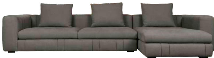
module 2.1 left + chaise longue right

An incredibly comfortable sofa, the objective behind the Lapo system was to bring together geometry and curves. The asymmetrical cylinders on the sides and back are slightly reminiscent of 1970s Milanese cosmopolitan style, along with the rounded seat cushions and armrests. This sofa is available in a 3-seater fixed version, a sofa bed version and a system made up of 10 different modules, allowing one to personalise its size and form to each space. It is an ideal sofa on which to relax and unwind.